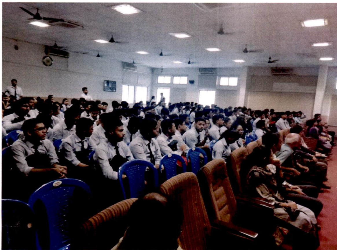
Students and faculty attending the session : Dated: 13/04/2017

The students and faculty attended the session with great enthusiasm, Around 169 students participated in the session.