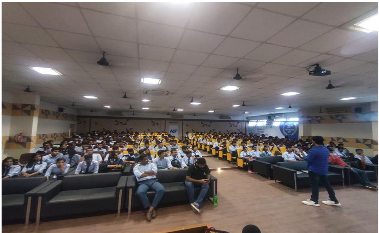
Language and Communication Skills Training CSBS (B. TECH)