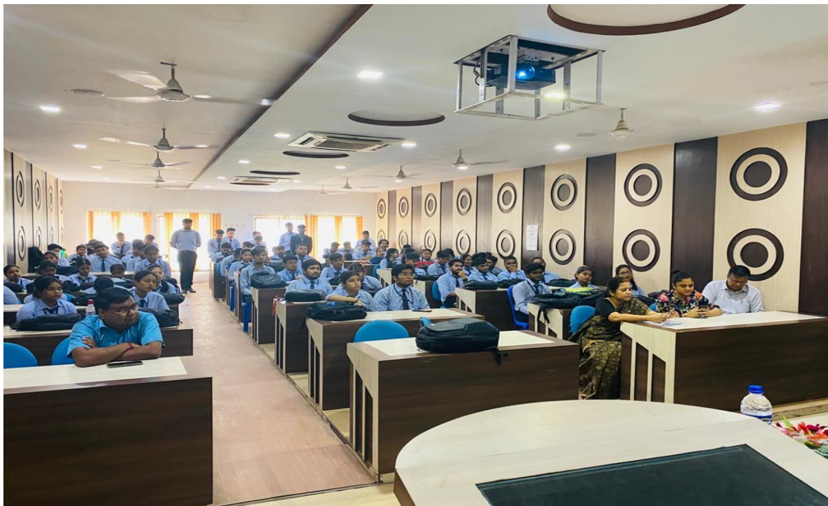
Language and Communication Skills Training AIML (B. TECH)