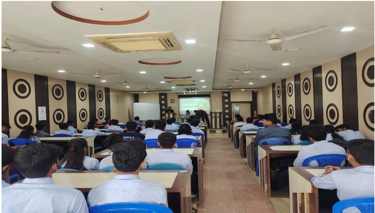
Language and Communication Skills Training ME (B. TECH)