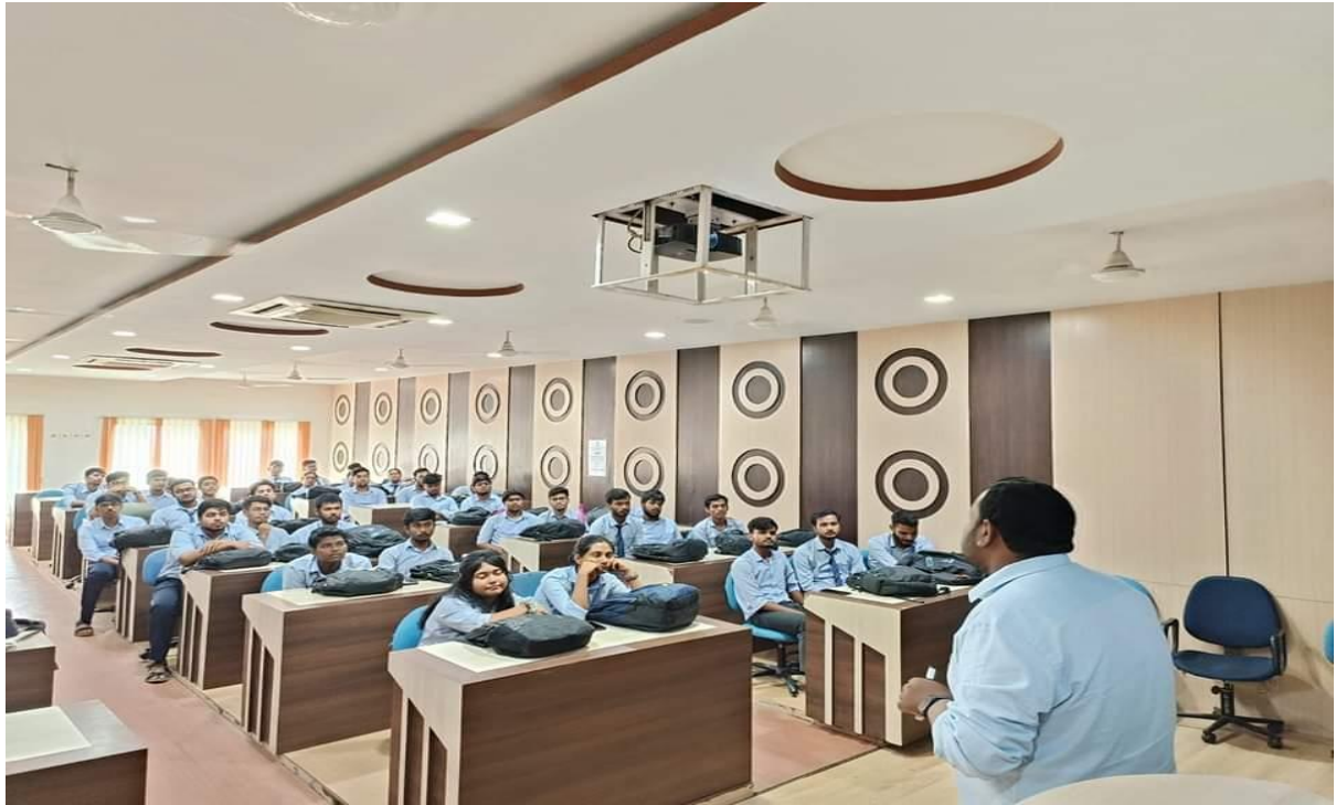
Language and Communication Skills Training ECE (B. TECH)