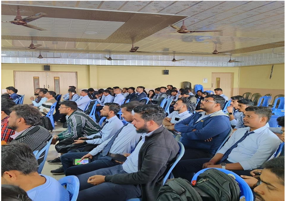
Language and Communication Skills Training EIE (B. TECH)