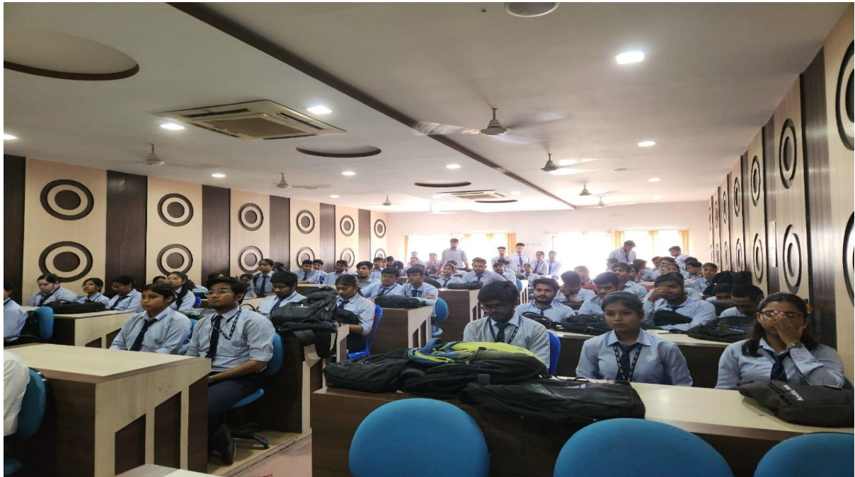
Language and Communication Skills Training CST (B. TECH)