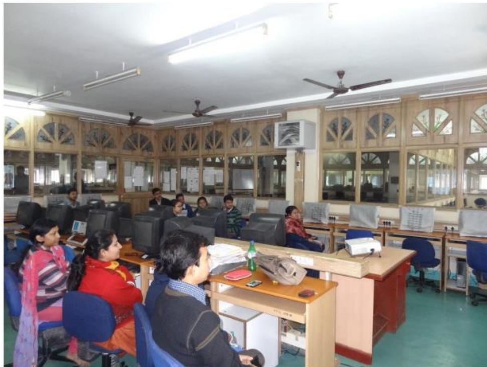
Glimpses of audience