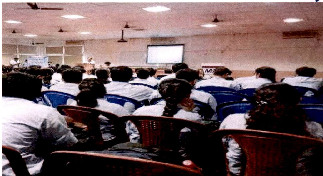
Session ongoing, Dated: 11/11/2017