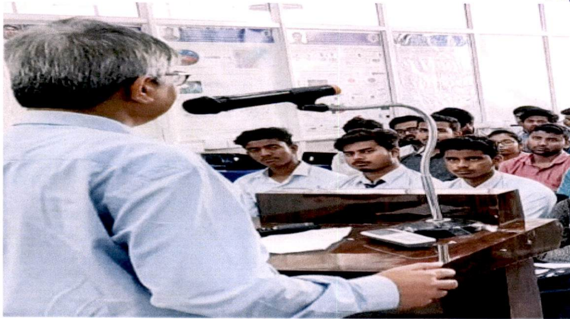
Students attending the session: Dated: 02.05.2018