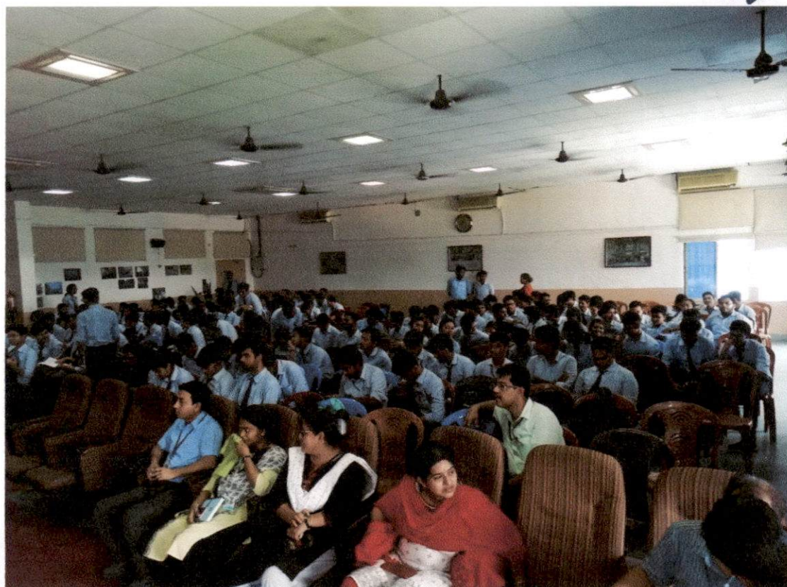
Audience attending the session: Dated: 23/08/2019