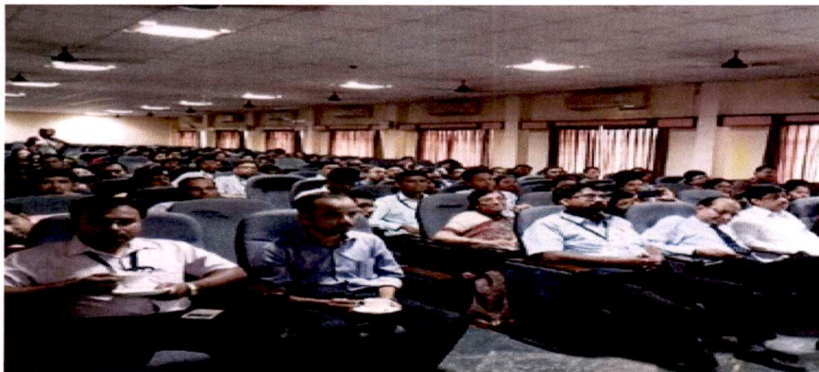
Audience, Dated : 19/1/2017