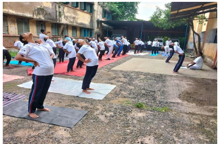
Our Cadets Taken active participation on Yoga Day - Celebrated at 4 WB (Tech) Air Sqn NCC