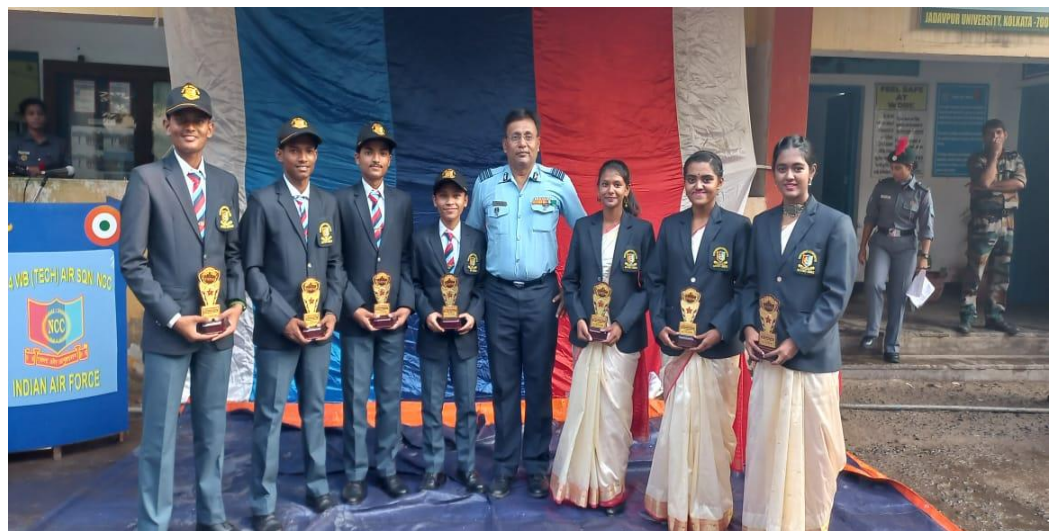
Award Distribution to AIVSC Jodhpur participants