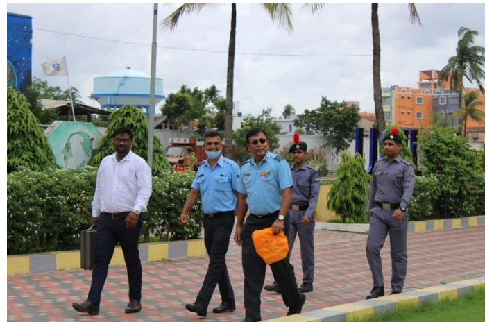
Aeromodelling Demonstration & Seminar on "Career in Armed Forces" at NiT Campus