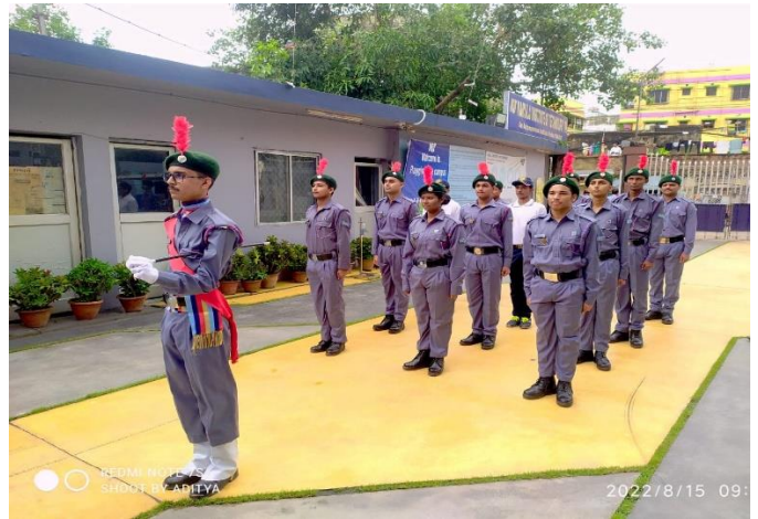
Independence Day Celebration at NiT Campus