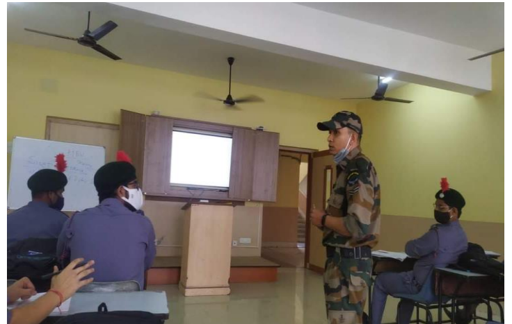
Parade & Theory Classes on Various Subject are taught in regular basis