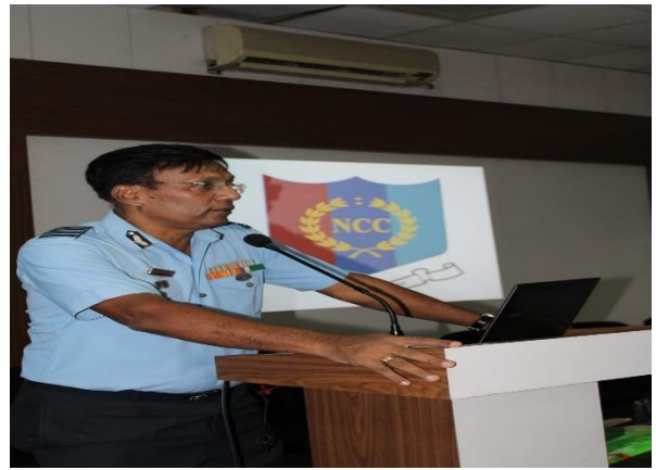
Misc. Events organized By NCC Unit