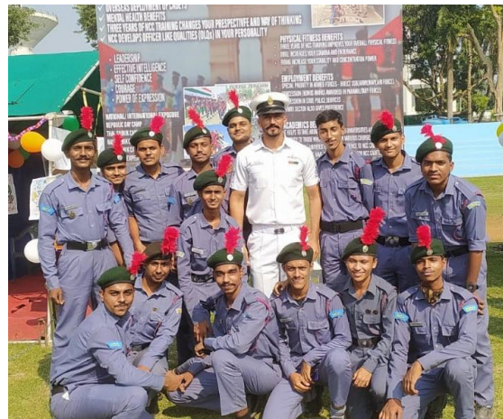
Visit to Indian Navy frontline War Ship at Khidderpore Dock Kolkata