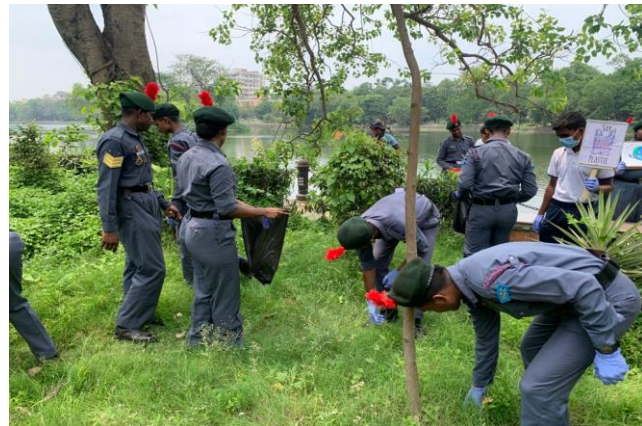
Water Cleaning Programme done at Rabindra Sarovar Lake , Kolkata